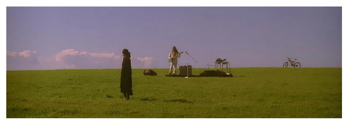
Figure 2: Scene from the movie Eli Eli, Lema Sabachthani? (Aoyama Shinji, 2005)