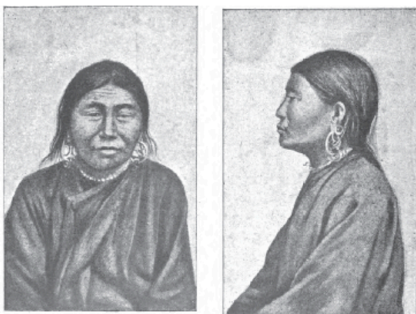
Figure 1: Sketch of a Gilyak Woman (Labbe 1903: 216)

The Gilyak were facing annihilation as a result of Russification policies and the spread of the diseases introduced by Russian settlers. Images from the time reinforce the sense of their alterity (figures 1 and 2). Chekhov's account of the Gilyak gently normalises (while forecasting) their eventual extinction. 'The Gilyak,' he writes, 'belong neither to a Mongoloid nor to a Tungic stock, but rather to an unknown tribe that was once perhaps magnificent and which ruled over all of Asia but which is now living out its last era on a small patch of land as a not very numerous, yet still beautiful and brave, people' (Chekhov 2010, 130). As if prognosticating their eventual disappearance from the earth, Chekhov writes that 'as a result of their unusual friendliness and mobility, the Gilyak have mixed with all of their neighbours, making it impossible now to encounter a pur sang [pure-blooded] Gilyak, who is not in some way related to a Mongol, Tungic, or Ain people' (130).