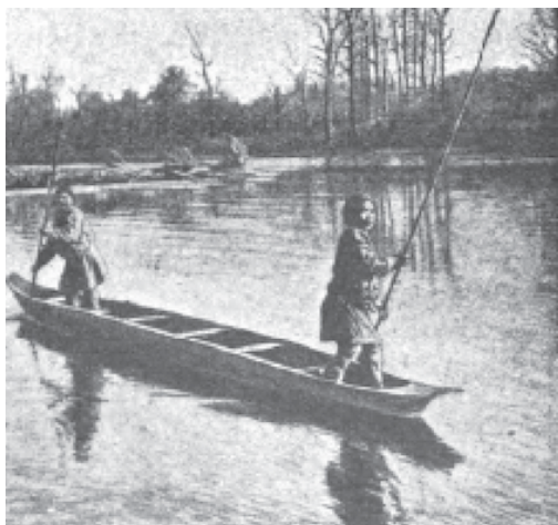
Figure 3: A Gilyak Canoe (Labbe 1903: 226)

From Chekhov's perspective, the Gilyak's racial impurity made the prospect of their eventual extinction less tragic and more inevitable. Here and elsewhere, Chekhov participates in a tradition of salvage anthropology that 'constructed a canon of authenticity...to filter modern adaptations from culture in order to discover a supposedly 'authentic' culture that had existed in the past' and to treat distance from this constructed authenticity as a sign of impurity (Nurse 2011, 63). Figures 3 and 4 reflect this impression of the Gilyaks as representatives of a vanishing form of life. Because the Gilyak were seen to be on the brink of disappearance, they were perpetually in need of the explorer-anthropologist who could reconstruct their life ways for a colonial readership.