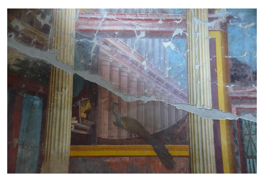
Figure 3. Villa Oplontis, Torre Annunziata (Naples), 1st century CE. Room 15, East Wall, detail.

Dionysius illustrates the aesthetic experience of Lysias' rhetoric as opposed to Isaeus' by comparison to the enjoyment of a gracile archaic line drawing versus the chiaroscuro and illusionism of a Hellenistic painting, and likens Isocrates' lofty style to the grand statues of Phidias and Polykleitos ( Isaeus 4 ; Isocrates 3 ).<sup>24</sup> These comparisons are anachronistic, with artistic references ranging from the archaic to the Hellenistic periods used of orators who were contemporaries in the 5th and 4th centuries BCE. Such pictorial contrasts are reflected in first century BCE Roman painting, as at Cubiculum B of the Villa Farnesina, depicting a fictive pinacotheca where archaic Greek drawings flank an illusionist Hellenistic painting.