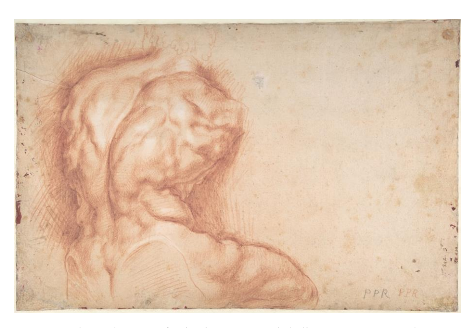
Figure 6. Rubens, drawing of Belvedere Torso, red chalk, 1601–02. Metropolitan Museum, Purchase, 2001 Benefit Fund, 2002.

The third area has its roots both in sophistic writings about artworks and the interest of Hippias in archaiologia (Plato, Greater Hippias 285d).<sup>53</sup> This concerns the antiquarian aesthetic that privileges the fragmentary state of artworks, provoking phantasies of restitution in the viewer's imagination. Renaissance antiquarianism also sustained the notion of goēteia, given the pervasive necromantic language used of recovering antiquities as a return from Hades.<sup>54</sup> The antique fragment can be seen as a peculiarly privileged case of an artwork whose significance lies in its reception, with the subjectivity and variability this entails (Figure 6). Scholars of Renaissance antiquarianism have noted the vulnerability of antiquities in relation to their audience and the tension between the fragmentary object and the imagined completion in the viewer's mind that "points to a greater wholeness than would any complete works" (Barkan 1999, pp. 124, 207). As Salvatore Settis observes, antiquarianism involved values and relationships quite different from the insistence on perfection and integrity in Aristotelian-Thomist aesthetics, where completion enables structural analysis and forms a prerequisite for claritas (Settis 1985, pp. 375-486). The antique fragment instead inspires a kind of improvisational completion in the viewer's imagination—kairos enters into the relation of viewer and object.