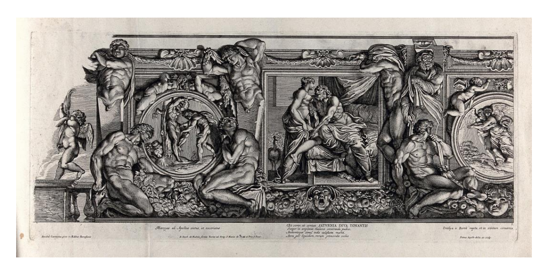
Figure 1. Pietro Aquila, etching from Galeriae Farnesianae Icones (c.1674) after Annibale Caracci, Farnese Gallery, Rome, 1597–1608. Marysyas flayed by Apollo, Juno and Jupiter and Oreithyia raped by Boreas, framed by ignudi and masks.

as a kind of unspoken Other to Platonism that concerns the admixture of deceit in idealism or the anxiety that the revelatory character of art may be merely a matter of effect: an admixture we might see, for example, in the motif of idealized ignudi juxtaposed with empty masks or larvae in Michelangelo and his followers, reprised in illusionist key by Caracci in the Galleria Farnese (Figure 1).<sup>6</sup> If Platonism in art had a basis in Cicero's claim in Orator (2.83.10) that the artist invents forms from access to the idea or draws forth forms that are immanent in matter (De divinatione II.21.48, perhaps following Aristotle, Metaphysics \Gamma 1002a), sophistic invention, as we shall see, draws on forms made by chance, on the basis of apparent resemblances, which we might therefore relate to kairos .<sup>7</sup>