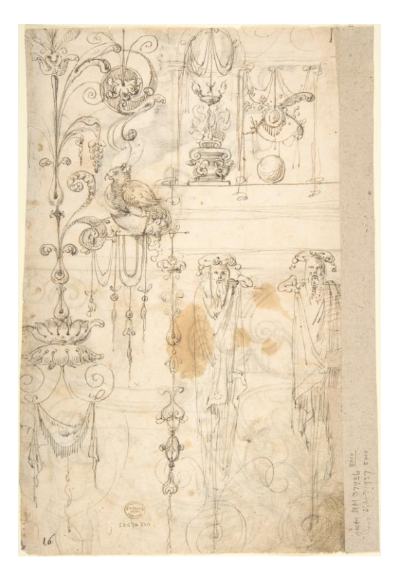
Figure 5. Andrés de Melgar attrib. Study with grottesche , ca. 1545–60. Metropolitan Museum, The Elisha Whittelsey Collection, The Elisha Whittelsey Fund, 1952.