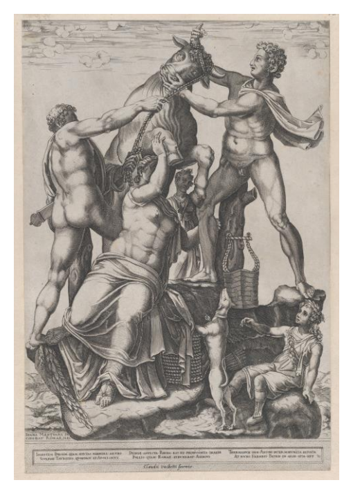
Figure 4. Diana Scultori, Speculum Romanae Magnificentiae , 1581, Farnese Bull . Metropolitan Museum, Harris Brisbane Dick Fund, 1941.

I noted above that the habitual denunciation of sophistry obscures perception of the degree to which post-antique art—and writings on art—engaged with the practices and conceptions that were in antiquity considered sophistic. Much of the ancient art rediscovered during the Renaissance was Roman imperial sculpture copied from earlier Greek originals—statuary created to adorn the monuments and public spaces, such as imperial thermae or gymnasia where the "deutero-sophists" performed or which they erected, such as the Farnese Bull , recovered from the Baths of Caracalla in 1546 for display in Palazzo Farnese (see Thomas 2017, pp. 181–201)<sup>50</sup> (Figure 4).