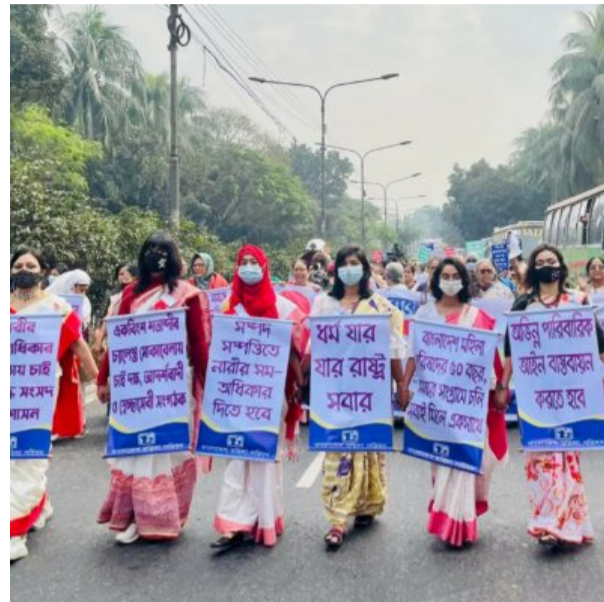
Radical within limits: Women's movements, civil society, and the political field in Bangladesh... ( https://melbourneasiareview.edu.au/radical-within-limits-womens-movements-civil-society-and-the-political-field-in-bangladesh/ )