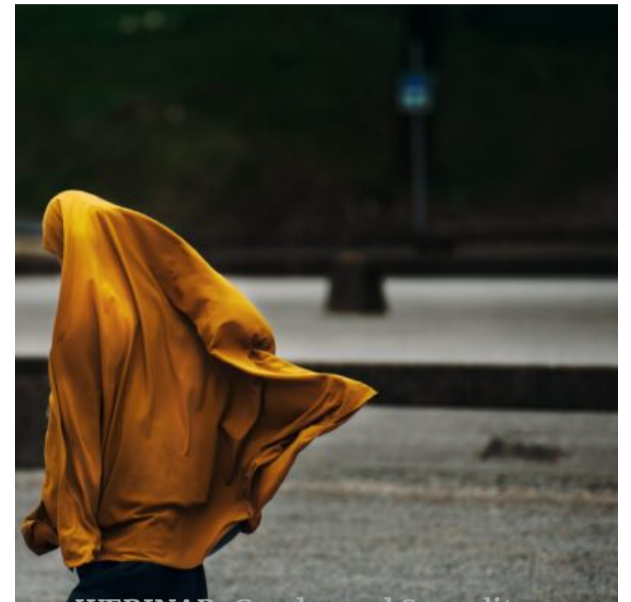
WEBINAR: Gender and Sexuality in Islamic Politics ( https://melbourneasiareview.edu.au/vgender-and-sexuality-in-islamic-politics/ )