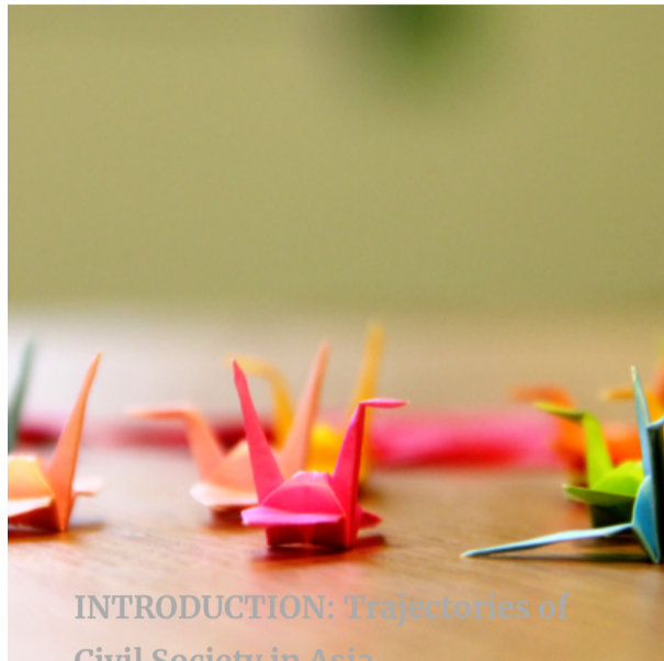
INTRODUCTION: Trajectories of Civil Society in Asia ( https://melbourneasiareview.edu.au/trajectories-of-civil-society-in-asia/ )