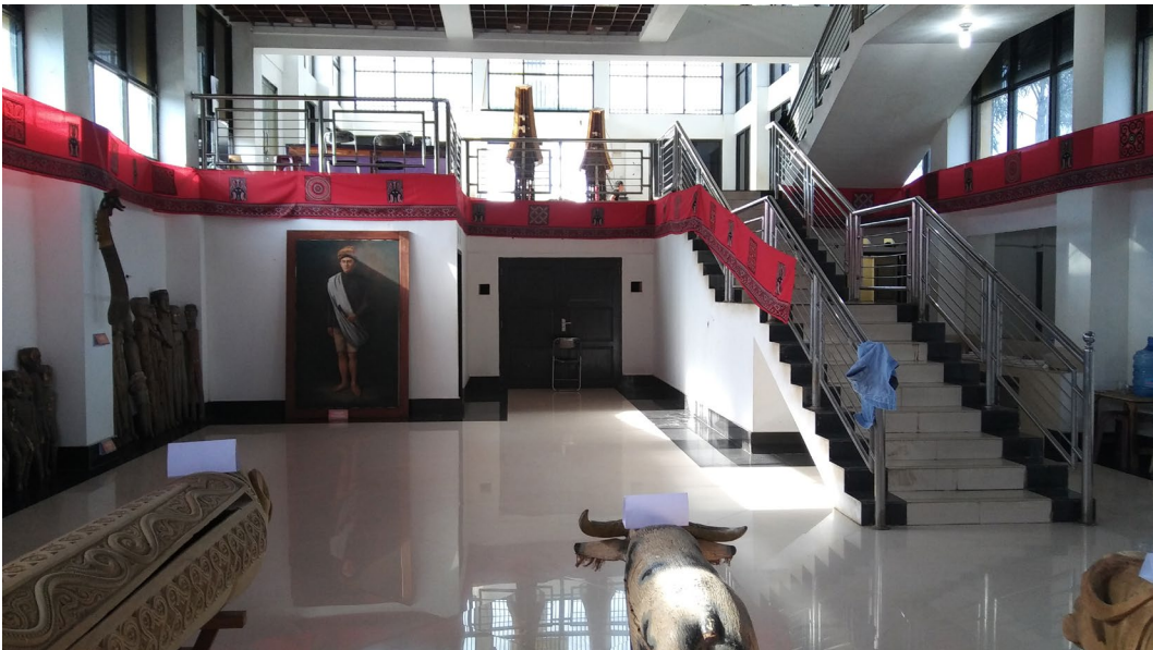
Figure 9. The basement floor of the Pong Tiku Museum of North Toraja, the zone dedicated to the "smoke-descending" (or death) realm.

The core of the initial collection consisted of two mummies that were confiscated when grave robbers were arrested fleeing the southern Toraja border. Additional recaptured heritage—effigies of the dead of unknown origin—were added to this base. The design and organization of the museum's displays also reflect Toraja poetics concerning the realms of life and death (or what Torajas term "smoke-risking" and "smoke-descending" realms). In the Toraja ethos, these two realms must be separated. Thus, the lower floor of the museum is devoted to items associated with the death realm, mortuary objects and mummies (Figures 9 and 10). The entry lobby separates this sphere from the upper floor, which contains life-realm items: cooking baskets, eating bowls, decorative textiles for ancestral house renewal rituals, and so forth (Figures 11 and 12). In short, the museum embodies a uniquely Toraja perspective on the organization and management of heritage.