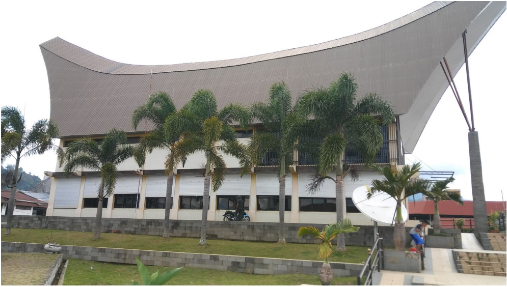
Figure 7. Pong Tiku Museum of North Toraja side view (7) and entry lobby (8).