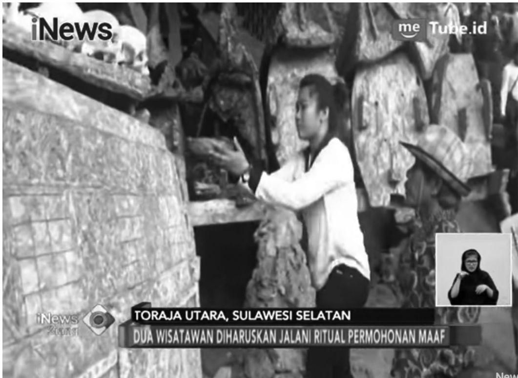
Figure 2. Tourist performing ritual reparations at ancestral grave site. 1

sacred ancestral spaces in terms of heritage management promises to enrich and expand our conception of museums. Moreover, such an approach produces more nuanced analyses of the cultural clashes that occur in these spaces as they become increasingly entwined with global institutions such as tourism and UNESCO. 3