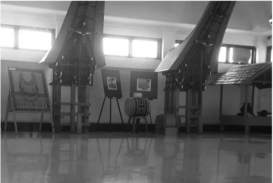
Figure 11. The upper floor of the Pong Tiku Museum, which is devoted to the smoke-ascending realm. Depicted here are rice granaries and other life-oriented Toraja materials.