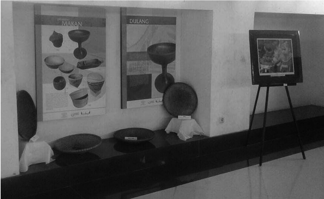
Figure 12. Exhibit depicting eating utensils on the upper floor of the museum.