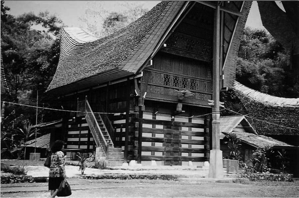
Figure 3. The Tante Ta'dung Museum in 1998 (a Toraja family-run museum).

informed by older Toraja frameworks for caring for collectively owned ritual paraphernalia and heirloom objects (some of which embodied supernatural powers and were sources of spiritual potency for the families that cared for them). These family-run Toraja museums served not only as storehouses and display spaces for these potent objects, but also as political instruments for reinserting their own families and ancestors into local and national history 4 (Figure 3). While influenced by the state's "museum-mania" and fueled by local elite desires to "cash in" on highland tourism, these private museums involved culturally distinctive approaches to caring for material heritage.