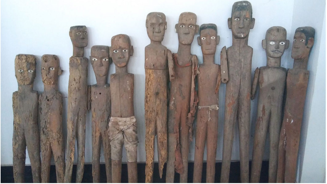
Figure 10. Recuperated stolen effigies line the basement wall of the Pong Tiku Museum of North Toraja.