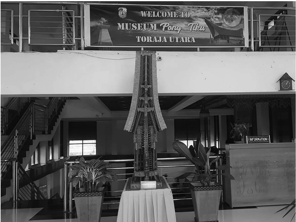
Figure 8. Pong Tiku Museum of North Toraja entry lobby, with staircase leading down to the smoke-descending realm ( rambu solo ) of death-related materials below. Upstairs, one finds Torajan exhibitions related to life-oriented activities or what is known as the smoke-ascending realm ( rambu tuka ). These materials generally center on harvest rites, food production, and ancestral house consecration rituals.