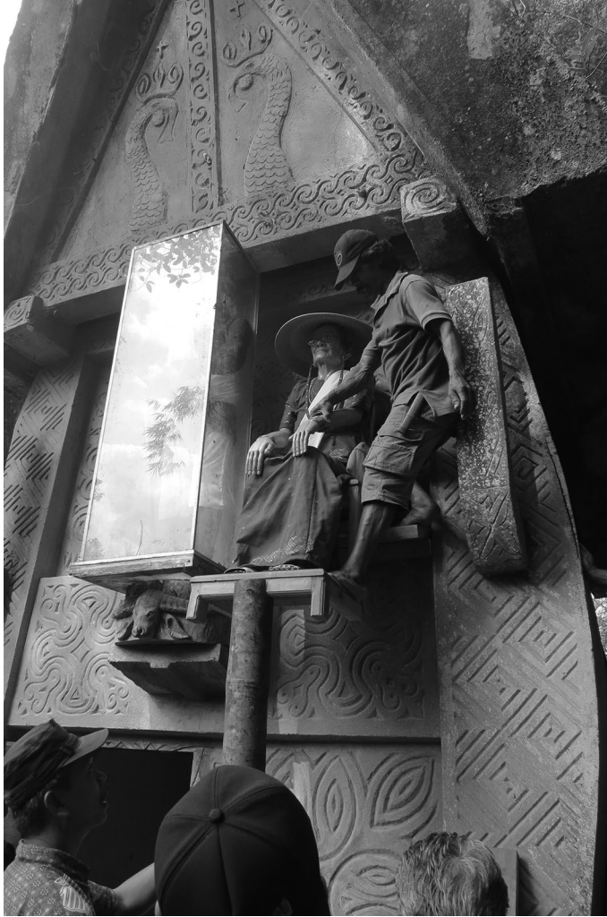
Figure 5. Effigy of the deceased being installed in a family tomb in the Ke'te Kesu' burial area, 2012.

some sport eyeglasses or tote Bibles. As Christian commissioners stress, these meticulously rendered details demonstrate the effigy's role as a "portrait" rather than a "pagan" soul receptacle. 10 These portrait-like effigies are generally not of interest to art traffickers and collectors, who prefer the stylized, weathered tau-taus.