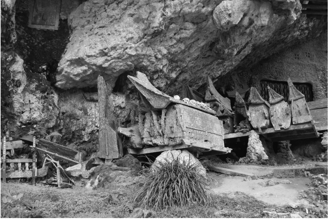
Figure 6. Ke'te' Kesu' burial area with padlocked effigy area visible in right-rear of photo.

upon, but ancestral embodiments requiring dutiful, ongoing human care. Just as art museums in Western history have long been associated with rituals pertaining to the care and nurturing of sacred heritage, so too is the case for these Toraja burial sites. 11