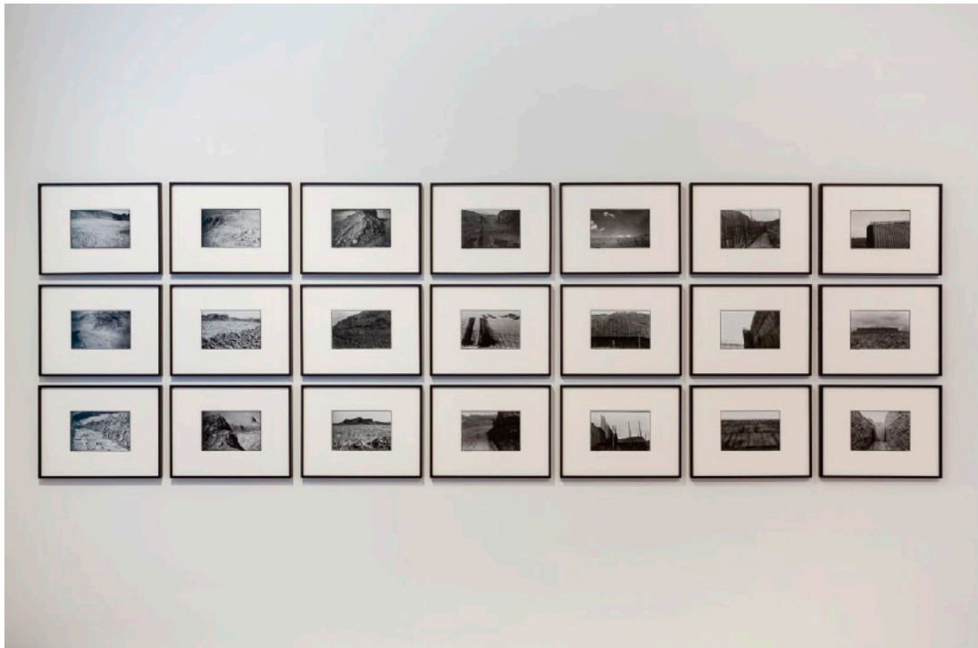
Figure 8. Mohammad Ghazali, from the Persepolis 2560–2580 series, installation view, Ab-anbar Gallery, London 2021.