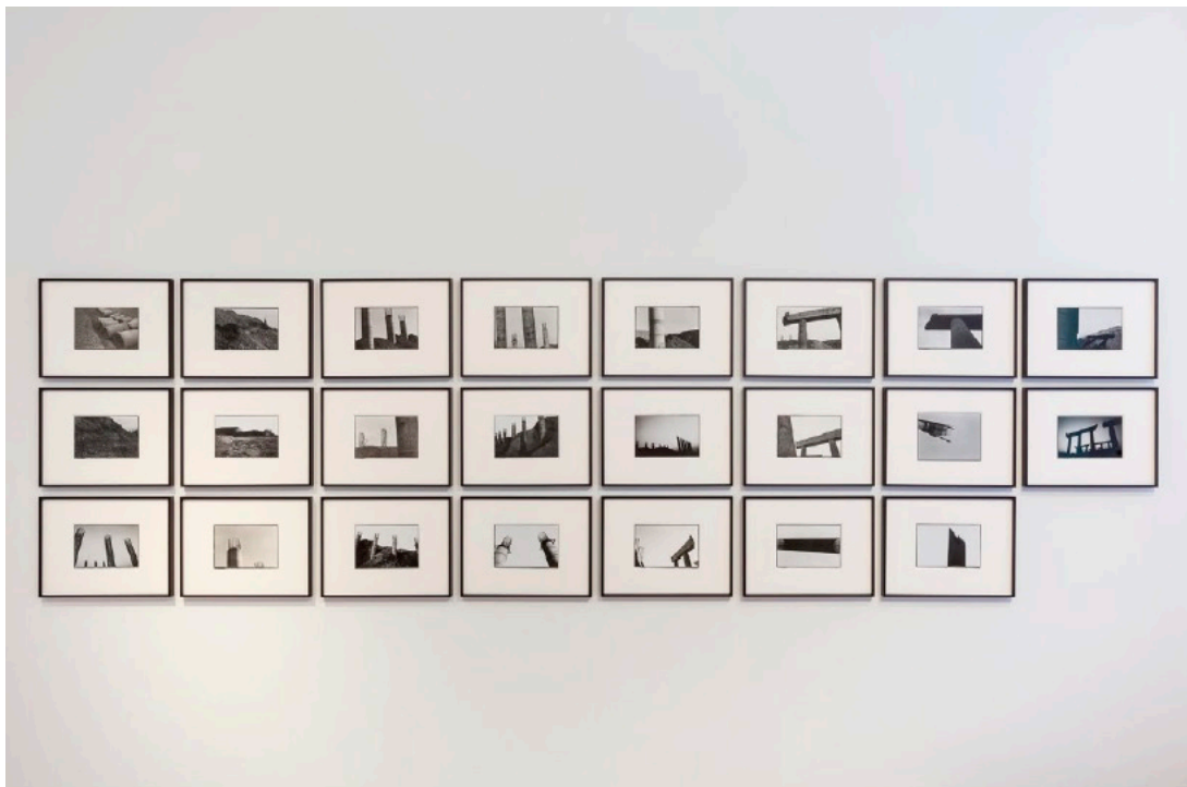
Figure 7. Mohammad Ghazali, from the Persepolis 2560–2580 series, installation view, Ab-anbar Gallery, London 2021.

Persepolis: 2560–2580 consists of a collection of thirty-eight small monochromatic images 18 mounted together on the wall to make a unified set, along with documentation used to emphasise their authenticity (Figures 7 and 8). 19 In the brochure of the exhibition, there are meticulous informative historical materials about ancient inhabitants of Persia, the construction of the palace of Persepolis including its architectural features, structural and decorative elements such as gates and motifs, etc. The photographs pretend to be the actual documentary of the construction of the ancient capital city of the Achaemenid Empire, Persepolis.