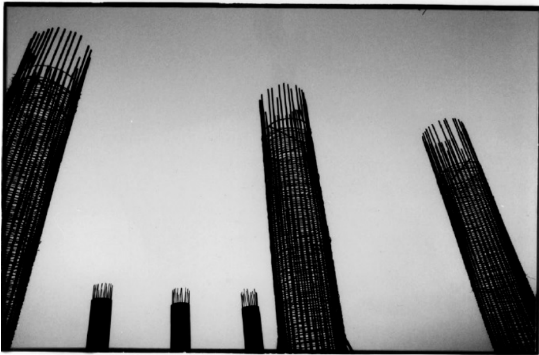
Figure 9. Mohammad Ghazali, from the Persepolis 2560–2580 series, Lost no. 017, 2001–2021, Analog photography, gelatine silver print, 13.5 × 20.5 cm.