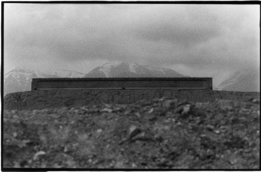
Figure 11. Mohammad Ghazali, from the Persepolis 2560–2580 series, Lost no. 024, 2001–2021, Analog photography, gelatine silver print, 13.5 × 20.5 cm.