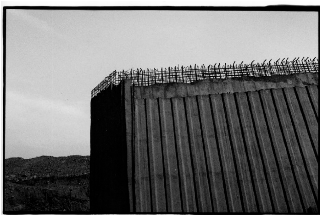
Figure 10. Mohammad Ghazali, from the Persepolis 2560–2580 series, Lost no. 023, 2001–2021, Analog photography, gelatine silver print, 13.5 × 20.5 cm.