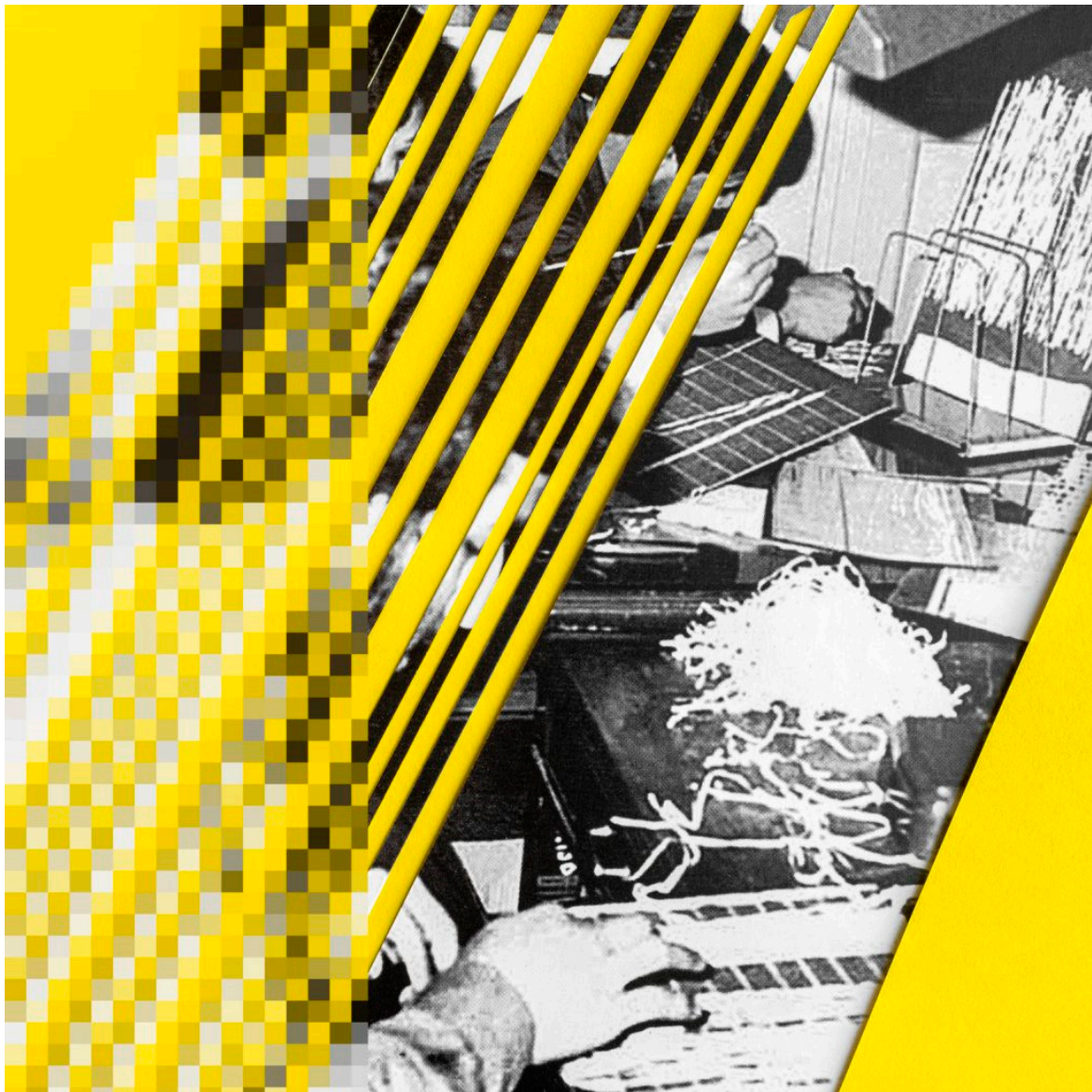
Figure 6. Parham Taghioff, From the Asymmetrical Authority series, 2018, photographs, HD inkjet print on archival acid-free paper, 50 × 50 cm.

Taghioff considers himself as an author who plays with the documented history of the earlier generations' struggles (Sumac Space 2021). He maintains,