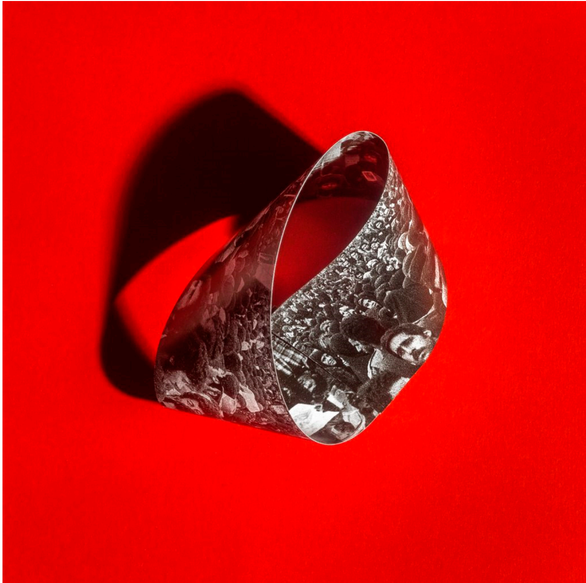
Figure 4. Parham Taghioff, From the Asymmetrical Authority series, 2018, photographs, HD inkjet print on archival acid-free paper, 50 × 50 cm.

books aim to serve ideological stories and reproduce hegemonic accounts of history. It is not surprising that in line with ideological trajectory of the Islamic Republic, this narration should be persuasive and promotive, meaning to portray a propagandistic account of the events—in particular the revolution and the war, which was named defā'-e moghaddas (the 'holy defence'), or other related events such as occupation of the US Embassy in Tehran by a group of revolutionary university students in 1979 (Figures 4–6). 12