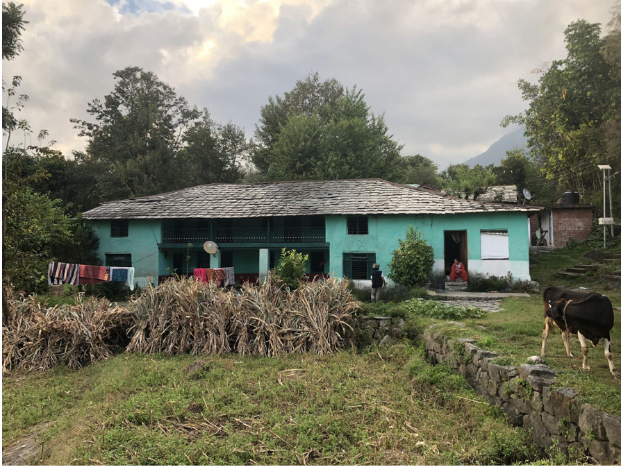
Figure 1. A Gaddi mud house.

labour. Where men are responsible for generating monetary income, women are responsible for small-scale subsistence agriculture and reproductive labour that is framed increasingly as housework ( ghar ka kaam ). This gendered division of labour has been codified in new patriarchal ideals of sexual propriety and respectability ( izzat ) (Phillimore 1982; 1991). It is buttressed by colonial and postcolonial legal regimes of marriage, inheritance, and land registry that shored up the boundaries of the household, specified its make-up, and prevented ‘improper’ practices of polygamy, divorce, and remarriage (Kapila 2004). Men have seen their dominance over property cemented through the codification of the single male descent line as the primary line of inheritance. Women have seen their right to access or seek maintenance from acquired property diminish, unless it is linked to this ancestral descent line.