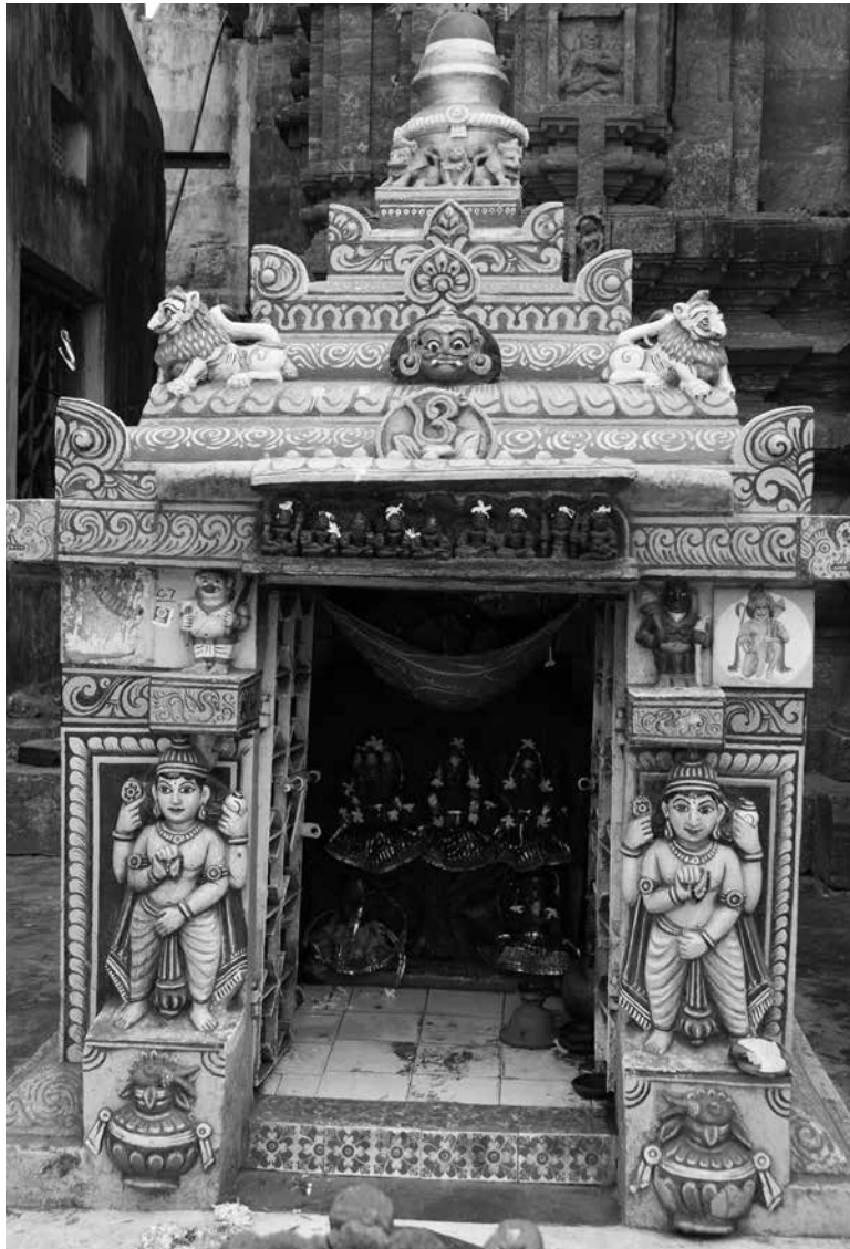
8 Minor shrine outside western entrance to twelfth-century Jagannatha temple, Puri, Odisha.

They ask how European scholarship was affected by input from temple builders and conversely how these builders working on the ground incorporated colonial antiquarianism into their own building cultures.