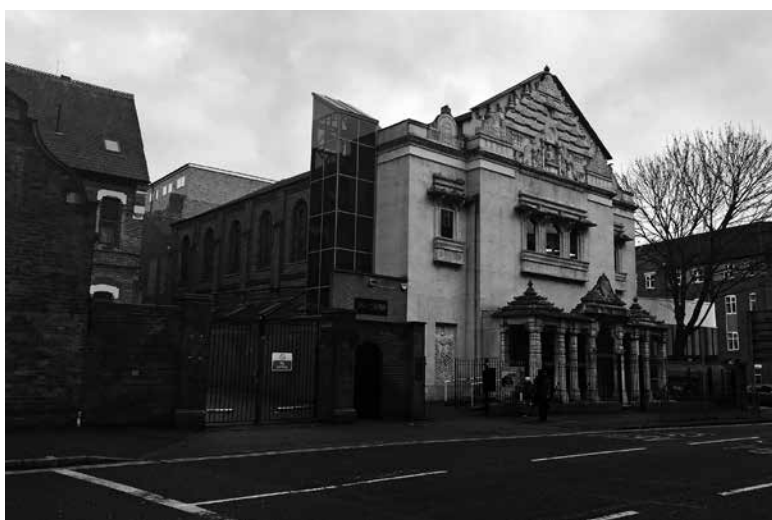
6 Leicester Jain Centre, built in 1863 and converted in 1988.

the construction of temples formally identifiable with similar temples in South Asia itself. Temples in the diaspora may also serve as community centres in a manner not required in South Asia, or are designed in a more ‘ecumenical’ fashion to accommodate and meet the devotional needs of worshippers from multiple Hindu sectarian or regional traditions. 20