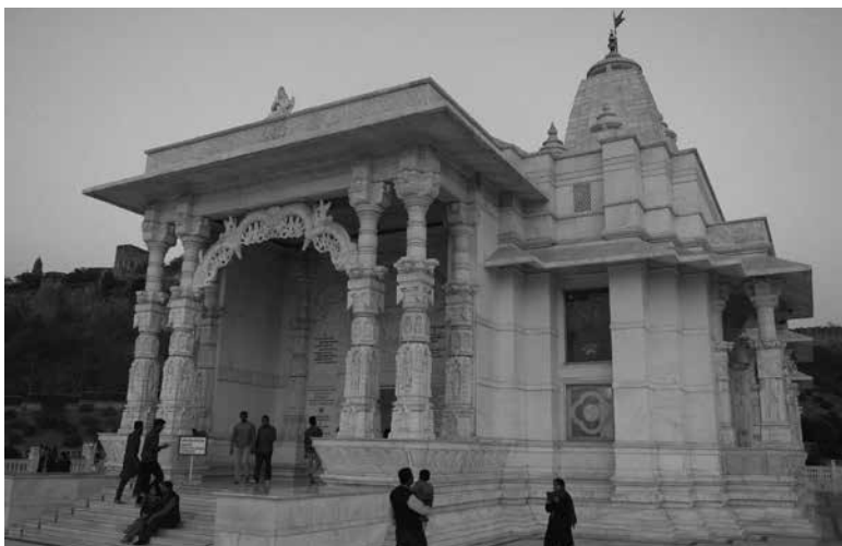
5 Birla Mandir (Lakshmi Narayan Temple), Jaipur, Rajasthan, completed 1988.

Only in the past two decades has there been significant interest in the temples built in the nineteenth century and later, among scholars from a range of disciplines. Historians and anthropologists of religion have conducted sophisticated analyses of modern temples and their worshipping communities in India and the diaspora. 18 But such studies may lose sight of the temples as built environments and are often less concerned with establishing detailed histories of construction, the analysis of design and space, and building processes and modes of knowing. Some architects and architectural historians have begun to examine the wealth of temples built in the past two centuries, but many questions and issues remain to be examined from the perspective of architectural history and knowledge production. 19 As suggested above, the design of temples in the contemporary global diaspora invite consideration of the adoption or adaption of historic traditions in new settings, such as the conscious evocation of ‘India’ in