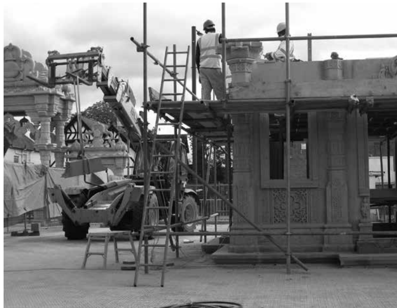
9 Construction of the Shiva shrine at the Sanatan Hindu Mandir, Wembley, London, 2011.

Articles in this issue of arq indicate potential avenues for further research by architects and architectural historians directed towards the study of the relations