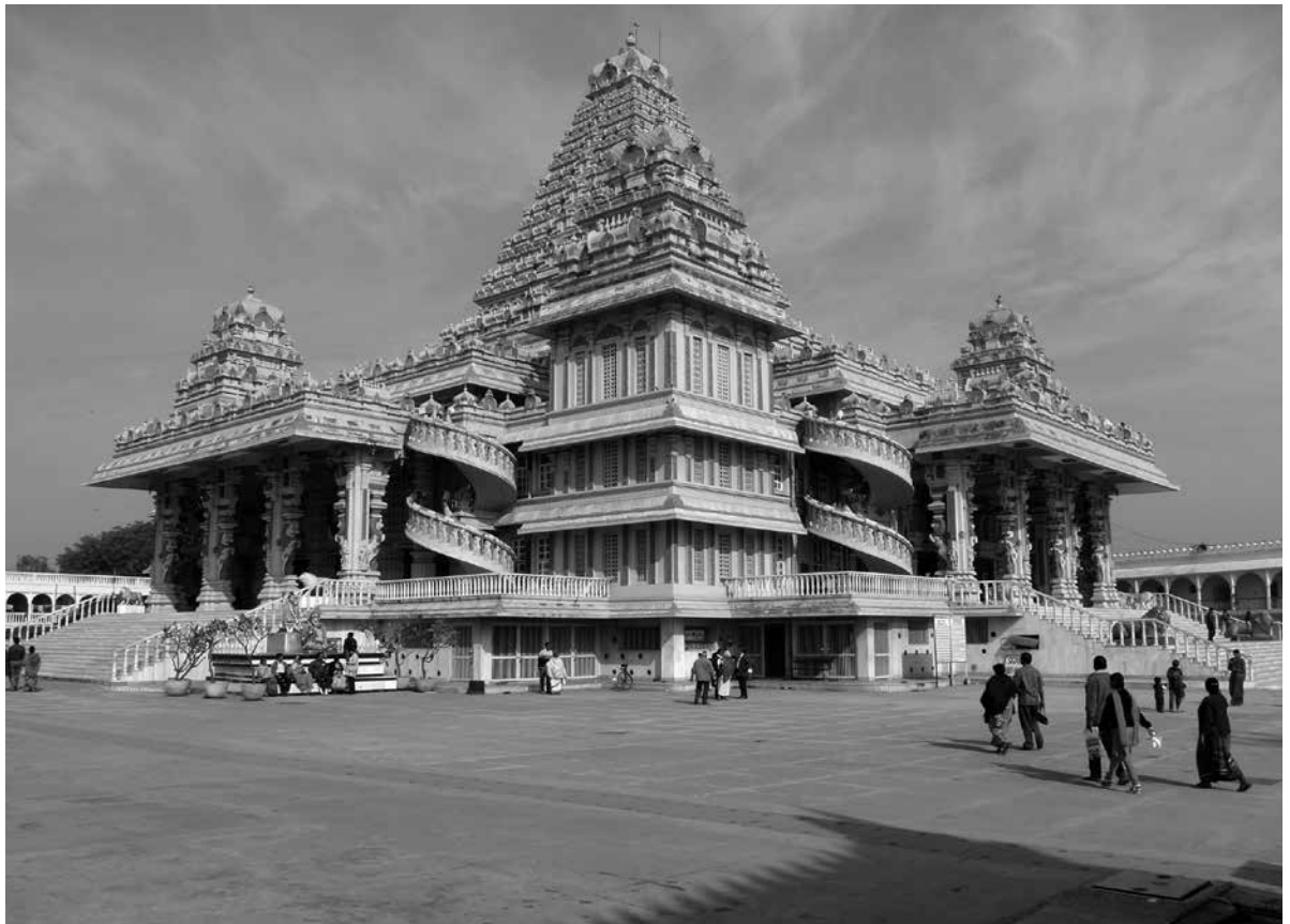
3 Laxmi Vinayakar temple (or Nutan Bhawan) within the Chhattarpur Temple complex (Shri Adya Katyayani Shakti Pitham, 1974 on), Chhattarpur, Delhi.

These familial builders complicate the ‘colonial modern’ through both the acceptance of the divine and also of the heterotemporality of the now. They open up wider questions about the architecture profession’s discomfort with practitioners on its margins. They also suggest that these two intersecting domains are more porous than they are assumed to be. The continuation of orientalist and ‘othering’ vocabulary used by architectural professionals is evident in the description of modern temples designed by traditionally trained builders as ‘unmodern’, ‘anachronistic’, ‘pastiche’, ‘kitsch’, ‘superficial’, or ‘pale imitations of ancient architecture’. The extraordinary temple complex at Chhattarpur in south Delhi, for example, has been described as ‘pastiche par excellence’ [3]. 11 When they are acknowledged as innovative, they continue to remain trapped in a relation of negation: as ‘endogenous’, ‘traditional’, and ‘counter-modern’.