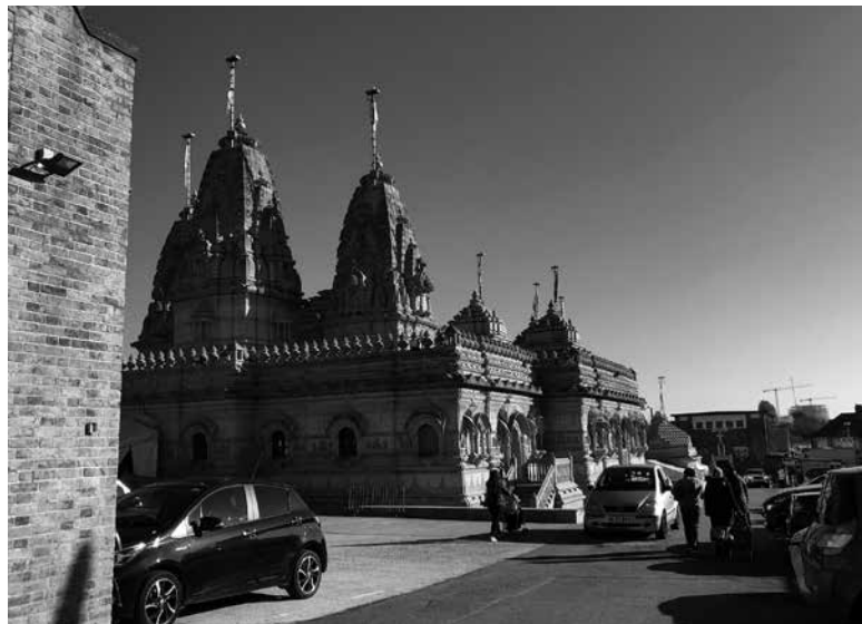
2 Sanatan Hindu Mandir, Wembley, London, completed 2010.

Many scholars have drawn attention to the imperial and racialised codes active in Fergusson's prodigious body of scholarship, which contrasted the progress of Western civilisation with the stasis or decline of the 'East'. 'The Indian story is that of backward decline', he wrote. 6 Yet he had undoubted admiration for living building practices in India, which seemed to exemplify mediaeval European building practice with designers and craftsmen working together on site. Fergusson was dismissive of buildings constructed in the 'West' after the fifteenth century, which he condemned as 'false styles' in contrast to Gothic, the last 'true style'. He felt that there was much to learn from past and present