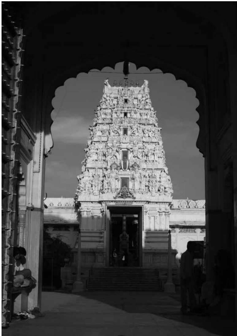
4 New Rangji temple, Pushkar, Rajasthan, late twentieth century.

Initially, these diasporic communities worshipped at home, in makeshift temporary shrines in domestic settings and in converted buildings [6], but as they became more settled, so increasing numbers of purpose-built temples have been constructed. The choice of Nagara or Dravida temple design provides an insight into the conscious selection of architectural vocabularies by diasporic communities for new spaces of worship in order to forge new community identities. The construction of wholly new temples following design practices familiar in South Asia often persists alongside the continued use of converted buildings. These temples emerged from local contexts and contingencies in the diaspora, while remaining tied to the geographic roots of the communities in South Asia. Thus, Nagara temples translated to diasporic contexts, have been built for migrant communities originally from Gujarat, Rajasthan, and the Gangetic plain in northern India. This includes the recent