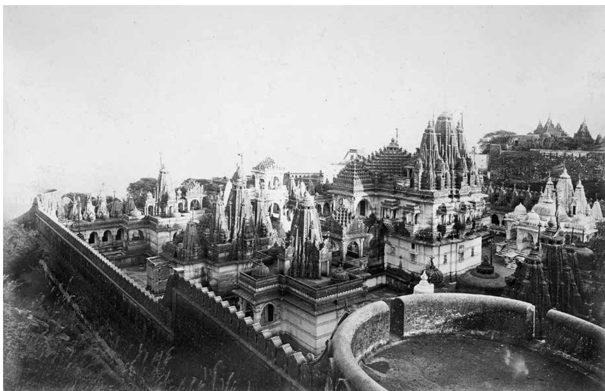
1 'Motisah Tuk from the northwest in Satrunjaya', Edmund David Lyon, photographic print from glass plate negative, 1869.