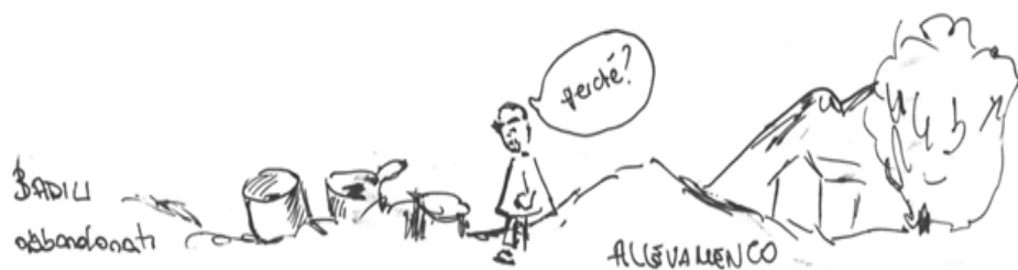
Figure 3 - Drawing made during fieldwork displaying a breeder wondering why he found some abandoned oil barrels on his field