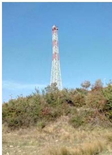
Figure 1 - The torch of an oil extraction site dominating the countryside. Suspicious flames have been reported by the residents - Corleto, October 2020

Fieldwork in Basilicata demonstrated that the essence of a civic sentinel is represented by the local dwellers that just use their bare human senses (e.g. smell, sight...) or – when needed – low cost sensors to detect environmental stressors around them. This can be regarded as what theoretically framed above as reversing the 'environmental amnesia', citing Kahn. 58 The sentinels then situate the data collected on maps which become a form of communicating local issues (often on the internet through their web pages).