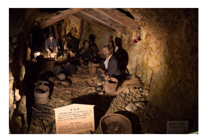
Inside a Sado mine tunnel with display mannequins.

Japan pledges to provide forthright discussion of the plight of Korean victims in historical interpretation of the Meiji Industrial Sites and clearly recognizes the forced labor that took place in the Sado mines.