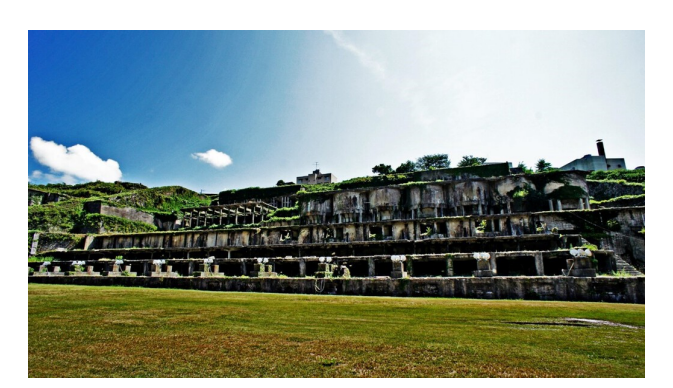
The Kitazawa Floating Plant. Photo by Itō Yoshiyuki (CC), Wikimedia Commons, 2013.

acknowledge the role of forced labor in the wartime mines.