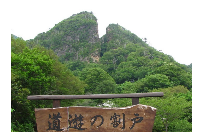
Dōyū nowarito outcrop in Aikawa, Sado. The mountain was split by Edo period surface mining. Photo by Muramasa (CC), Wikimedia Commons, 2013.

parliament representing Niigata.<sup>[7]</sup> Needless to say, history written by the perpetrator is not adequate for disproving allegations of victims.