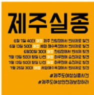
FIGURE 3 'Jeju's Missing Women' viral post reported in (Hani 2018)

As mentioned earlier, the trending hashtags ‘Secure Safety Rights for Jeju Women’ and ‘Save Jeju Women’ were important indicators of online discourse, expressing fears over the presence of male Muslim refugees in Korea.