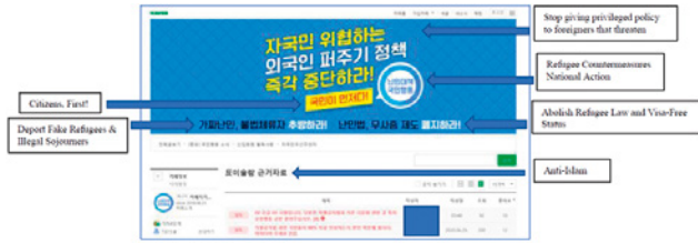
FIGURE 2 Refugee Countermeasures National Action Homepage

calls on politicians to abolish the ‘refugee law’. Other demands revolve around abolishing international marriage agencies and eroding the rights of long-term foreign residents in Korea. 5 It also shares information about its anti-refugee and anti-foreigner activities, such as organizing offline demonstrations, articles, and organizing offline meetings and rallies as well as creating hateful social media content. The café is organized around its main political apprehensions, spanning a wide range of issues, such as fine dust, North Korea, multiculturalism, illegal immigrants, China, LGBTQI issues, and, most importantly for our discussion, the café has a comprehensive section on Islam and Muslims. This section is categorized into Anti-Islam Evidence, Islamic Articles, Islamic Video, Islamic Information, Islamic Terrorism/Crime, Islamic Supporters, and Muslim Support Policy. Much of the content about Yemenis, Muslims, and refugees are filed both here and under ‘Refugees/Defectors’ in the sections called Evidence Data for Anti-Refugees/Defectors or Refugee/North Korean Defector Articles. Figure 2 (above) illustrates the Café’s homepage.