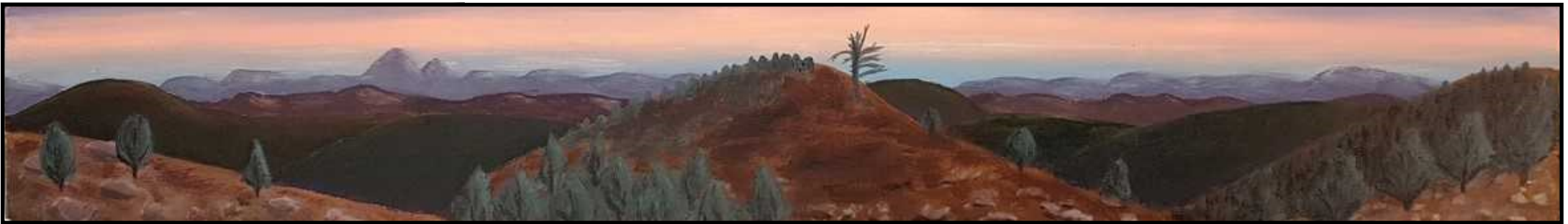
Bridgette Minuzzo, "Greeting the Dawn, Oratunga" (synthetic polymer on reclaimed cedar board, 13 x 93 x 1.4 cm)