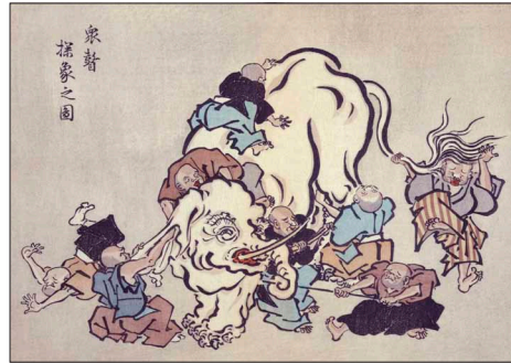
Blind monks examining an elephant, by Hanabusa Itchō

That is the environmental/contextual deficiency. To put it more clearly, the inability to conceive the reality of the elephant is not due to an inherent disability in human mind per se , but due to the darkness/environment surrounding it. This darkness caused by the 'night', constitutes a thick veil preventing those approaching the elephant from the full comprehension of the truth of the elephant. The extent to which one can get rid of such veils and be freed from such constraints varies from one individual to another. Therefore, people