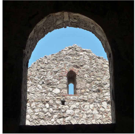
To seek parts of the truth wherever it arises

Fourth, Hick approaches the question as a pluralist whereas Nasr approaches it as a perennialist. Although the two terms are often used interchangeably, there is a subtle difference between the two departures. Even though both agree that there is no single true religion, they differ as regards to the universal truth. That is to say that while pluralism endorses a partial understanding of the universal truth, perennialism holds that each religion provides in its own terms