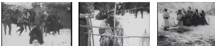
Fig. 4-5-6 - Divine Dispatch Commonly Called the Ainu Bear Festival (Neil Gordon Munro, 1931).

nusa , where the fire is burning and prayers are made to the Shirakamba kamui and the spirit of the bear. The elders dance a tapkara as a farewell.