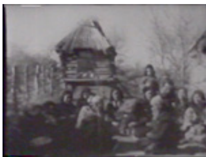
Fig. 7 - The Ainu Bear Ceremony (edited in 1961).

Munro donated the film to the Royal Anthropological Institute (RAI), where it was shown on the 10 th January 1933. RAI made a new edition in 1961, with the assistance of the Nuffield Foundation and Edinburgh Film Productions, under the title The Ainu Bear Ceremony , in which the original length was significantly reduced, from 52 to 28 minutes. 30 Essentially, all of Munro's written texts were removed in this second version and replaced with a voice-over giving it a more conventional format for screenings. Some scenes were shortened, and a couple of new images were added, mainly a part of the opening scene in which a group of men perform a ritual greeting, ongami , surrounded by women sitting in a circle.