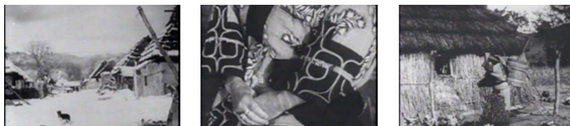
Fig. 8-9-10 - Iyomante . In a Mysterious and Lyrical Land (edited in 1965).

with a voice-over. The structure remains roughly the same, although a number of new images are added from the remaining 35 mm footage that Munro hadn't sent to England. Those are mainly added to the first ten minutes and included a map in the opening sequence, landscape of Saru River Valley, Ainu chise , traditional houses, female tattoos, close-ups to Ainu children, a scene on women's life, carrying water and wood, a toddler, weaving, and men transporting trunks on horse carriages, canoes and a water supply. 31