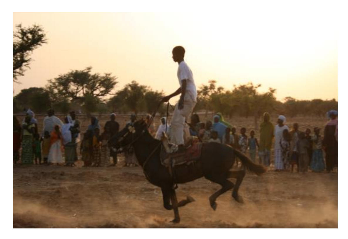
A young Fulbe man shows off his riding skills to a local crowd, Bandiagara, 2010

Horses have been in the West African savannah at least since the 9<sup>th</sup> century, probably introduced to the region by Berber traders. They are still widely used for transport in rural Mali. For some populations of the middle Niger valley, such as the Fulbe, skill in the saddle is an important aspect of cultural identity to this day. (The Fulbe are a large and influential ethnicity throughout West Africa who have lived alongside the Mande for centuries).