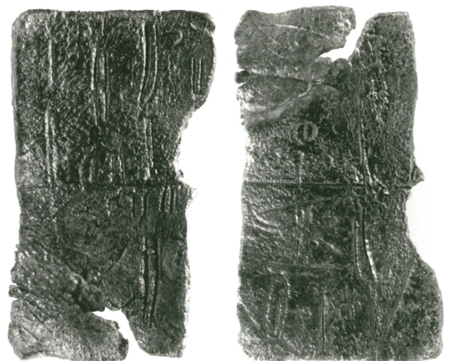
Fig. 2 Photograph of YH100004, obverse and reverse