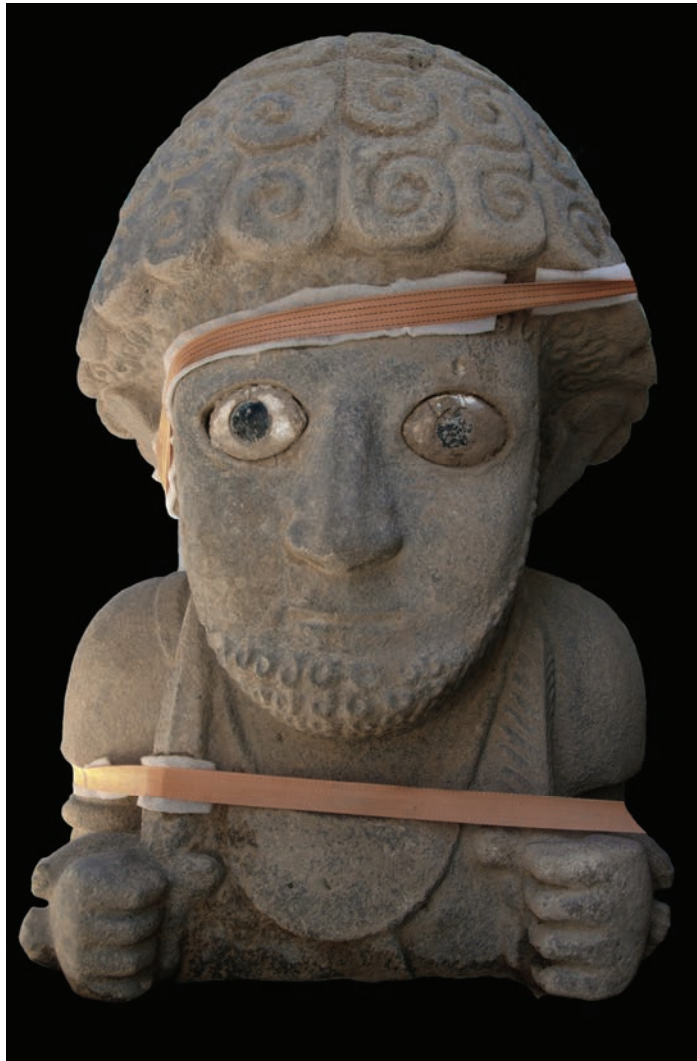
Fig. 4 Suppiluliuma (II?) from Tell Tayinat

evidence from the capital of the land of Palistin, providing the two rulers are in fact the same in both Luwian and Assyrian documents. Thus we would have some evidence for a further Hittite title (Labarna) being continued in this kingdom right into the ninth century BC, although there is no other such evidence. Note that the proposed identity of the new Suppiluliuma (II?) with Sopalulme is the only incidence of a synchronism between Assyrian and local documentation that we have for the region.