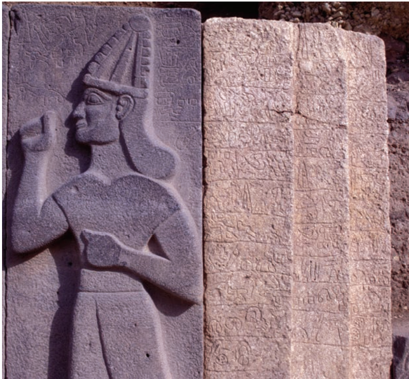
Fig. 3 Head of Taita I with Inscription