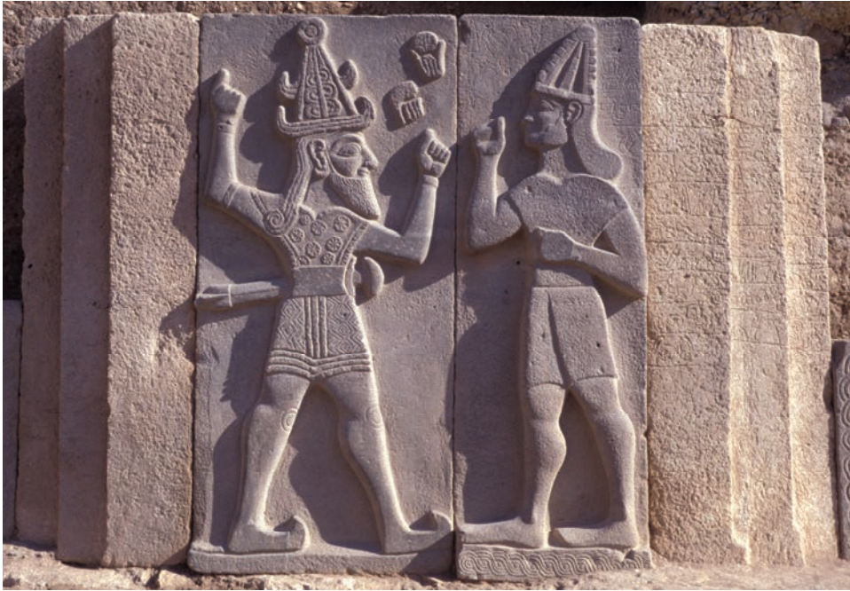
Fig. 2 Aleppo temple inscription of Taita I