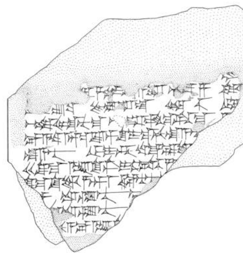
3 'For sure it's Enkidu, born in the uplands'.

'This fellow – how like in build he is to Gilgamesh, II 40 tall in stature, proud as a battlement. For sure it's Enkidu, born in the uplands, his strength is as mighty as a rock from the sky.'