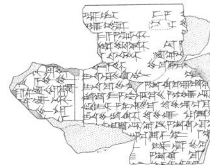
2 'Like a wild bull lording it, head held aloft'.

It is he who is shepherd of Uruk-the-Sheepfold, [but Gilgamesh] lets no [daughter go free to her] mother. [The women voiced] their [troubles to the goddesses,] [they brought their] complaint before [them:]