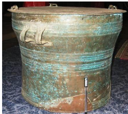
Figure 5. Alabaster image of Thagyarmin as sima , Thit-she-bin Monastery ( c. 60 cm, left); Heger 3 'frog' bronze drum, Shwetaung Monastery ( c. 45 cm ht, right)