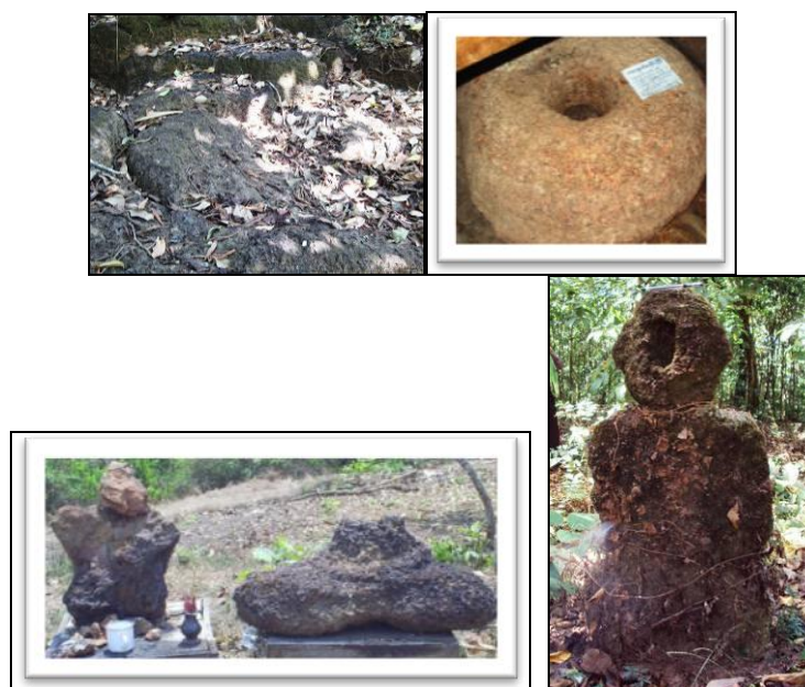
Figure 6. Laterite finds from Dawei (top): Yat-kan-taung quarry site with incised ring, donut-like ring from Yat-kan-taung monastery donated to Hpaya Gyi museum collection in 1904 (c.80 cm dia); (bottom) image of the Buddha from Min Yat (c.1 meter ht) and anthropomorphic figure Kyat-yat-twin

Launglon Township (Figure 6). An inscribed stone kept at Min Yat monastery is also from Kyat-yat-twin.