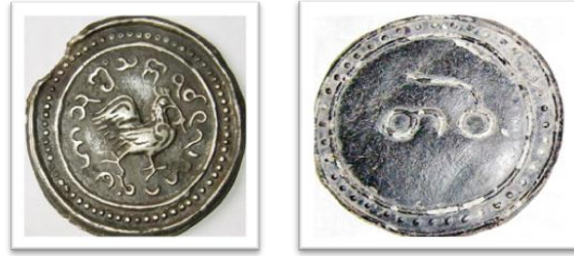
Figure 9. Tin coin with rooster and 'ta-weh' on the reverse; 6-7 cm dia, Than Swe Collection.

Most tin coins, however, have a central lotus-animal- naga motif with three lower rows of dots or wavy lines. 100 Writing is found on the reverse of most coins; the script is modern Myanmar reading Maha-thukan-nagaran or city of great happiness.