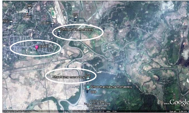
Figure 3. Location of Thit-seh-bin (top) and Shwetaung (lower) monastery in relation to Dawei town (left)

as seen at Pyu sites in Upper Myanmar. Nonetheless, there are considerable tracts of rice fields with large numbers of urns whose proximity to Thagara indicates cultural links. The urns may be of high status individuals, with the combination of bone and ash possibly suggesting a pattern of monastic burial only later followed by cremation and deposition of urns. 40