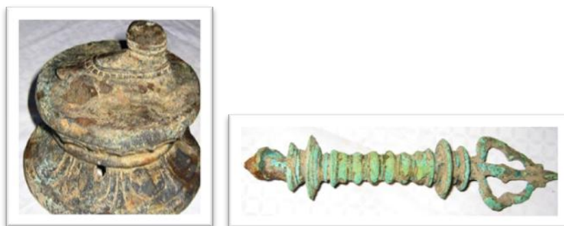
Figure 8. Bronze foot and ritual object kept at Mokti monastery.

In addition to these examples, there is also a bronze Heger 3 drum kept at Shwetaung monastery (Figure 5). The drum is sometimes considered to be ‘the original’ but at other times, drums in Zayawadi Monastery and the Catholic Church are rumoured to be the original and the Shwetaung piece an