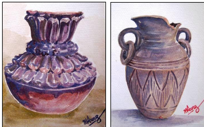
Figure 1. Glazed wares from Sin Seik, circa 15-17 th century CE, paintings by Myint Aung, Ministry of Culture, June 2010.

This report argues the contrary, that Dawei resilience in the face of continual threats sustained a local cultural personality that has survived until the present. The question is addressed by first classifying the sites of Dawei into four cultural zones and then discussing the extraordinary range of artefacts from these zones by material. 3 This is preceded by a chronological summary to illustrate the often turbulent history and local chronicles.