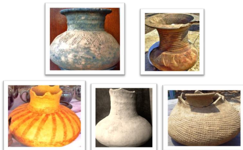
Figure 7. Urn types, top row Type 1 and 2, bottom row, Types 3-5.