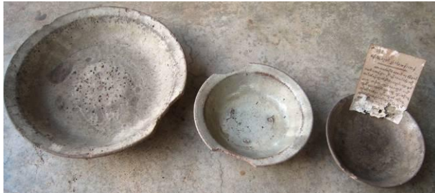
Figure 12 Green glazed bowls from Maungmagan (15, 18 and 28 cm diameter), Hpaya Gyi Museum, from land of U Pyo Leh.