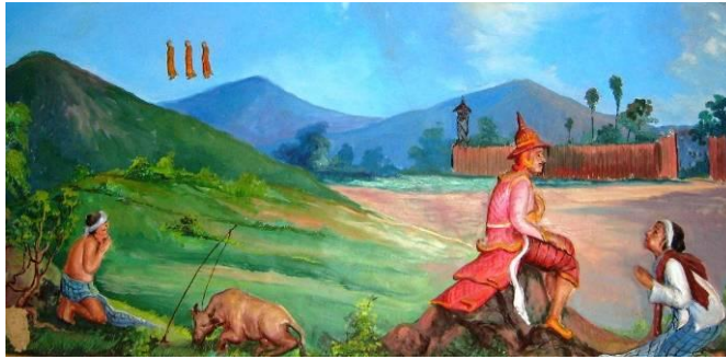
Figure 4. Painting on relief from main shrine room of Yat Kan Taung, Dawei. The young man guarding the bull informs the town officer of the arrival of three monks to the mountain.

number of Sukhothai and Ayutthaya style 13 th to 17 th century CE artefacts to light from Sin Seik.